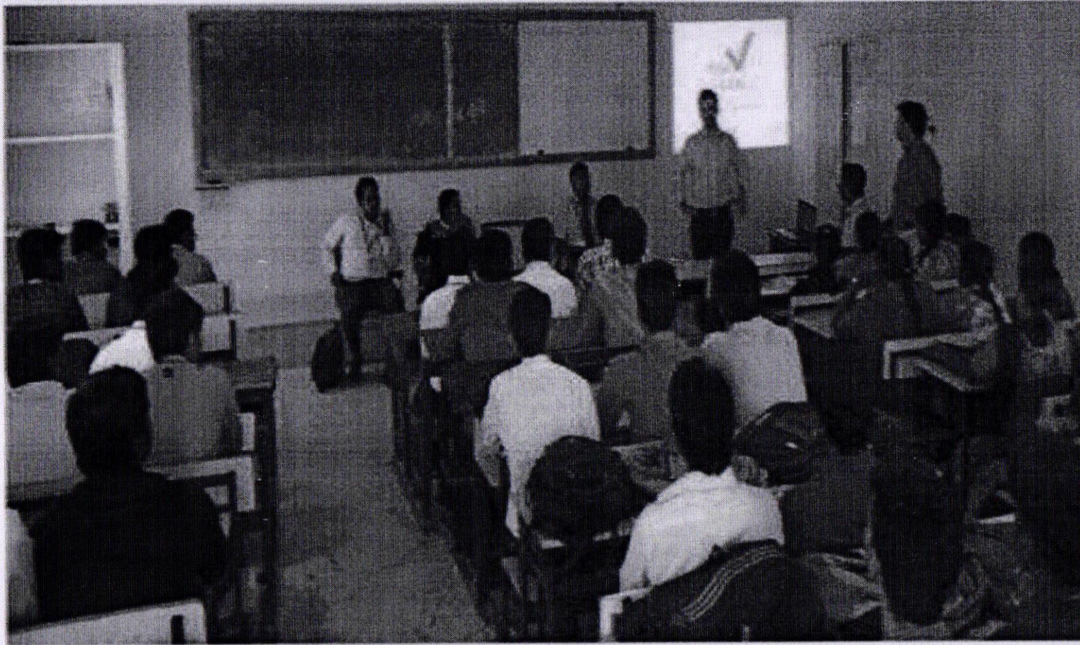
Value Added course: Entrepreneurship on 09/02/2017