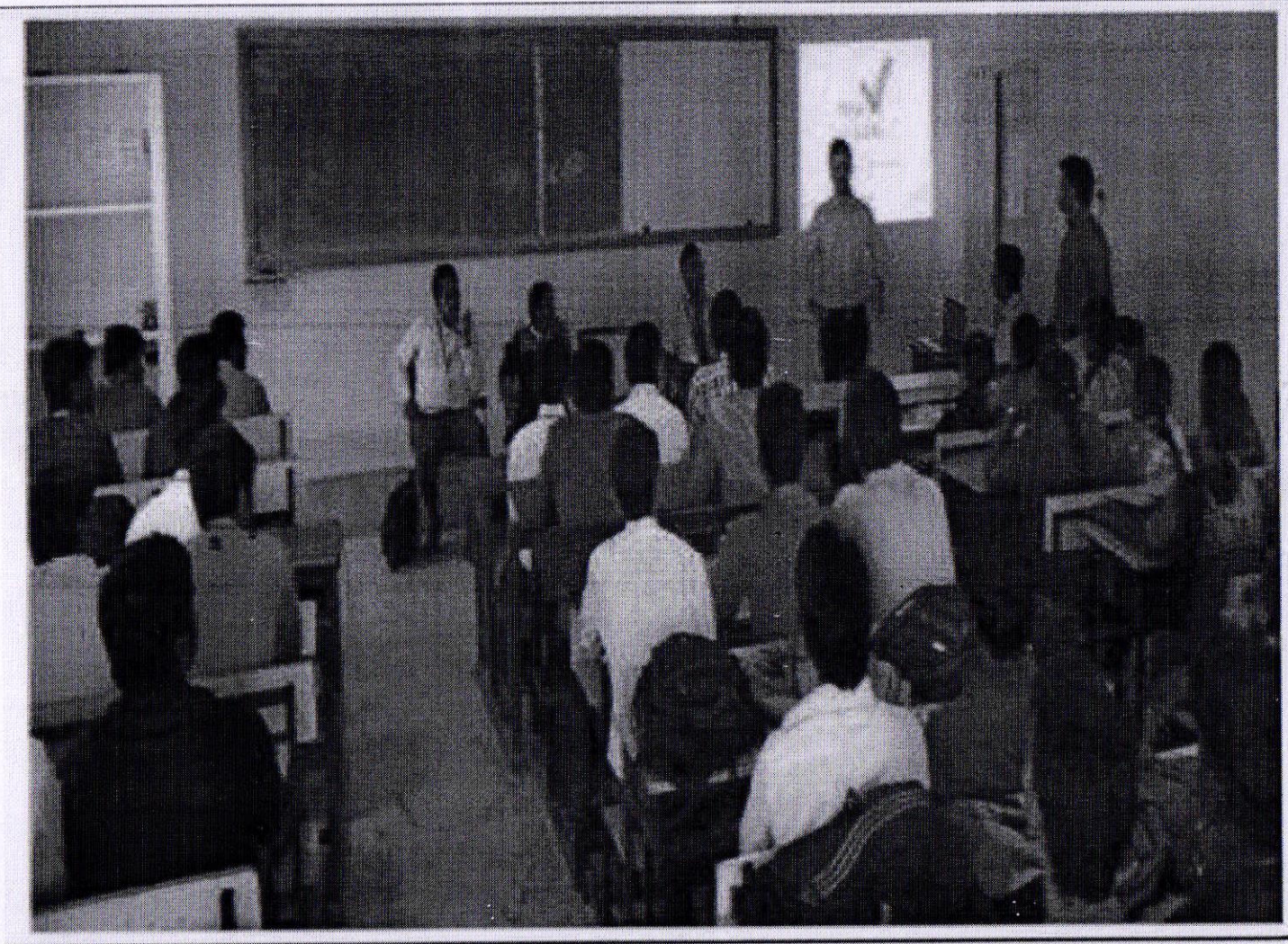
Value added Course: Quantitative on 25/9/2018