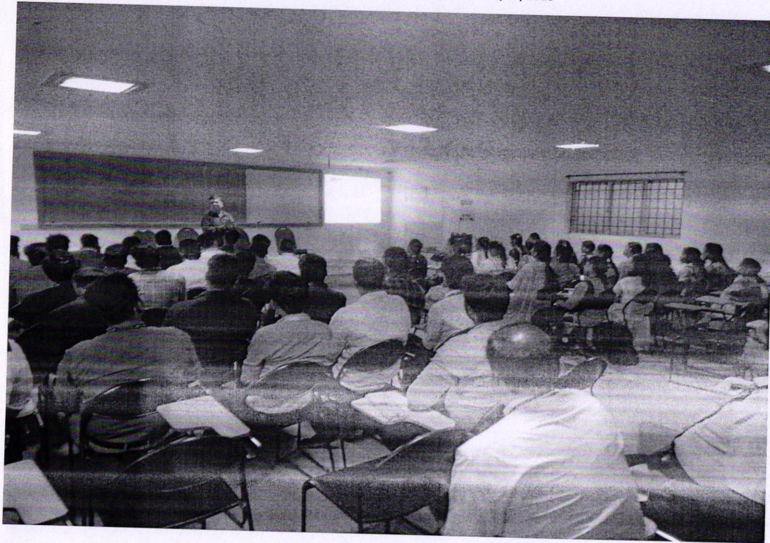
Value added Course: Financial Services on 18/01/2018